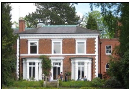
Manresa House on a sunnier day!

As is often the case, the informal sharing over a good lunch and washing up was equally important. We met and talked and often laughed about our experiences, joys, fears, triumphs and occasional hurts. We realized that the environment where we practice may differ widely but we are there for the same purpose. We come to bring the light of Christ's presence, whether overtly in evangelism or in silent witness, to our surroundings and can transfer so much of our individual experiences and skills.