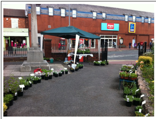
From the church doorway to the High Street

Birmingham Community Acupuncture use a room in the church hall which has been refurbished to local health authority clinical standards. Not only has a new business offering therapy to the community at an affordable price been assisted, but the same room also provides a venue for the annual 'flu-jab' event run by a local medical practice.